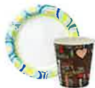
Paper Cups, Plates (Trash)